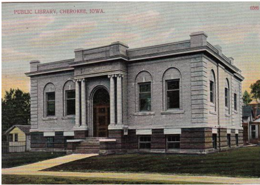
Cherokee Public Library (1905)A Carnegie Library on the National Register of Historic Places since 1985.

The Cherokee Area Archives offers an ever-expanding collection of information related to the past and present.