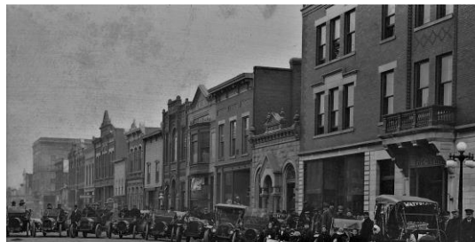
Cherokee Commercial Historic District on the National Register of Historic Places since 2005

If a visit to the archives is not possible, the staff can still provide historical information, research specific questions, and locate family information for you. Please contact us via telephone, mail, or email.